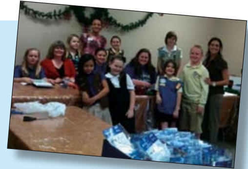
Pictured above: Girl Scout Troop 208 help to prepare packages for the dental patients.