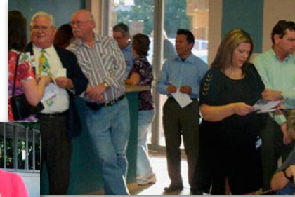
February Chamber After Hours