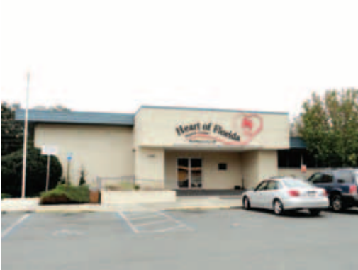
Heart of Florida Health Center 2013 REPORT TO THE COMMUNITY

NON PROFIT ORG US POSTAGE PAID OCALA FL 34478 PERMIT # 100